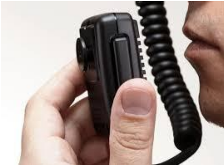
Cobra C75 WXST

The PACE Miata Club HIGHLY recommends using CB radios during PACE Miata Club drives. They add a safety aspect to the drive and for all our drivers. Plus, we've found that chatting on your CB during a drive is just a lot of fun.